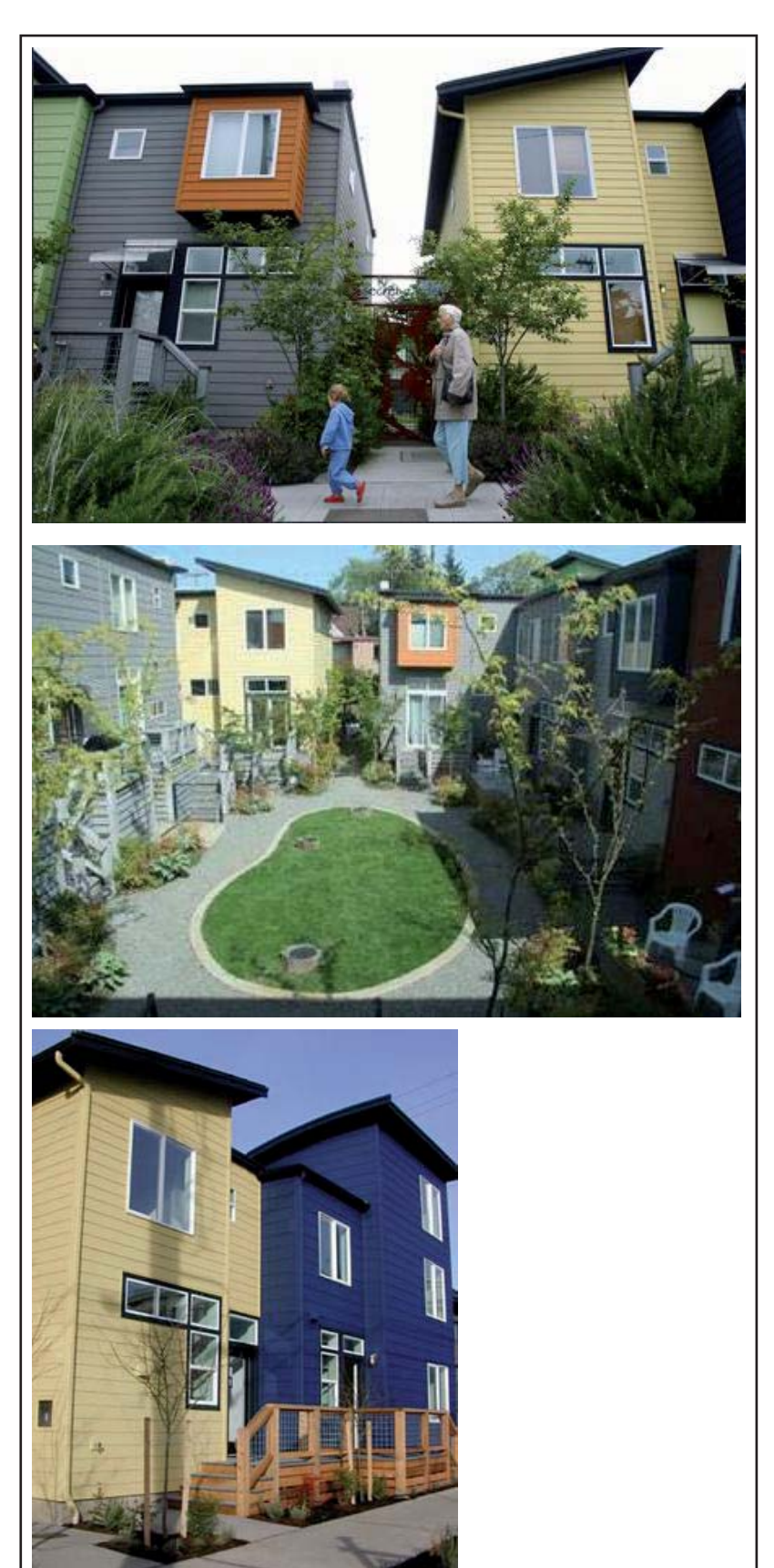
Secret Garden, Capitol Hill, Seattle